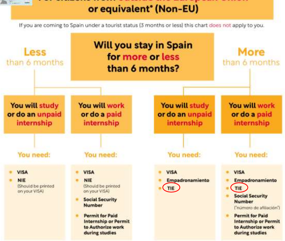
For citizens from outside the European Union or equivalent* (Non-EU) If you are coming to Spain under a tourist status (3 months or less) this chart does not apply to you.

If you are from a country not belonging to the European Union, European Economic Area or Switzerland and you are going to be in Spain for more than SIX MONTHS, YOU SHOULD APPLY FOR THE T.I.E.